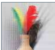
ARALUX® Millennium glass