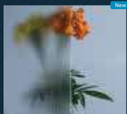
ARALUX® Pyramid glass