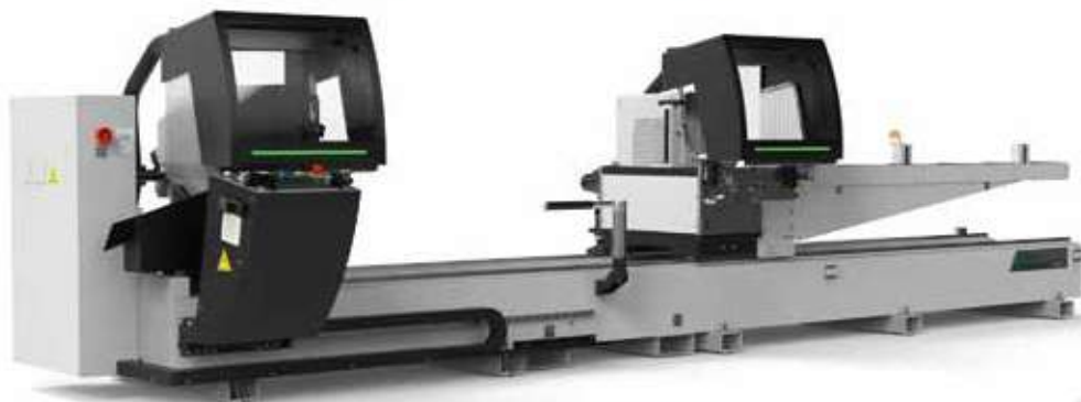
Double head sawing machine

with Ø 500 mm tungsten carbide blades with controlled movement of the mobile head and pneumatic control of the head tilting