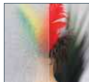
ARALUX® Nashiji glass