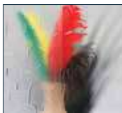
ARALUX® Dewan glass