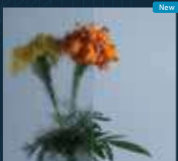
ARALUX® Matrix glass