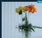
ARALUX® Reeded Glass