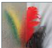
ARALUX® Nashiji Bronze